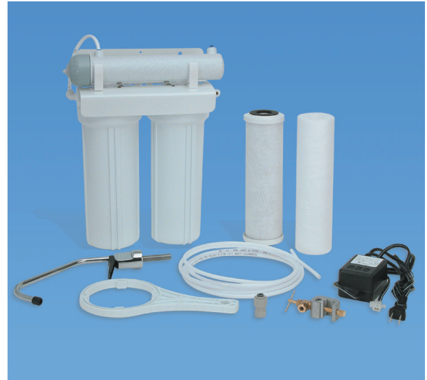
ADWU-D-UV (with UV lamp)