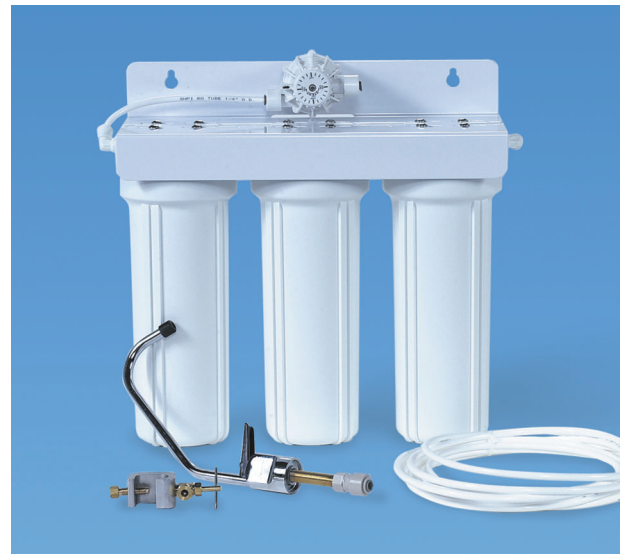
ADWU-TM (with meter)