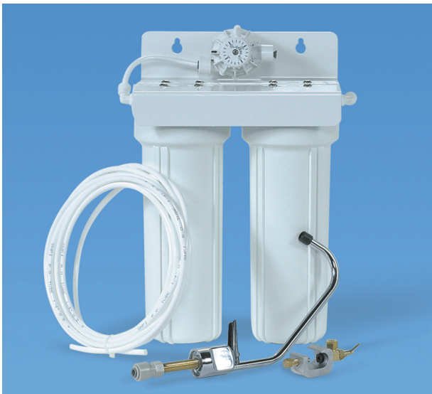
ADWU-DM (with meter)