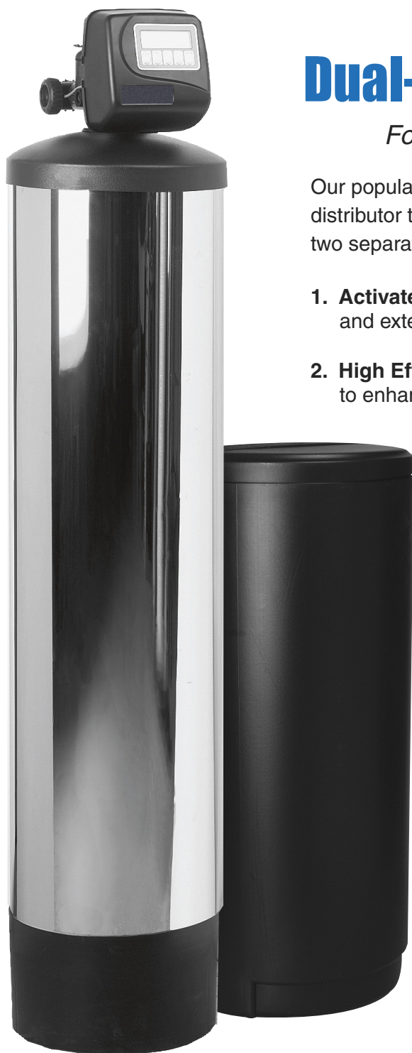
Shown with optional stainless steel jacket